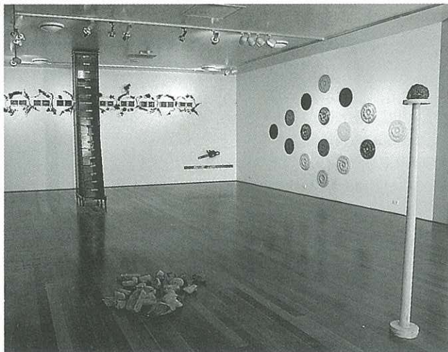
Inland, 1990, group exhibition, installation view