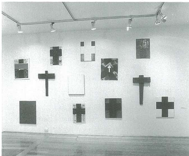
John Nixon, Self-Portrait (Non-Objective Composition) , 1983/4, installation view, Australian Visions exhibition, 1985

Catalogues and publicity material are regularly produced by ACCA to accompany its exhibitions and Special Events programmes, in order to assist and expand public understanding of contemporary visual arts issues and practices. They also provide a valuable and permanent record of recent and current Australian art.