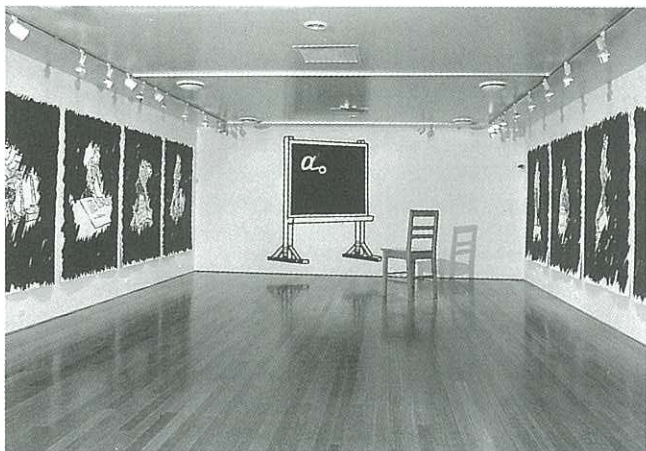
Aleks Danko, What are you doing boy? , 1991, installation view