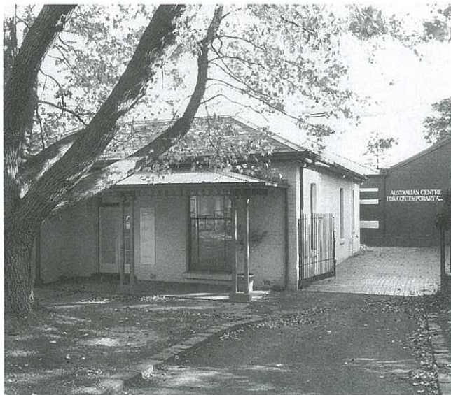
Australian Centre for Contemporary Art

Volunteers provide valuable support for our staff in the daily administration of the Centre and with special projects. If you would like to contribute your skills, and some of your time, why not join our team of volunteers who work closely with staff members. Please contact our Administrator for further information.