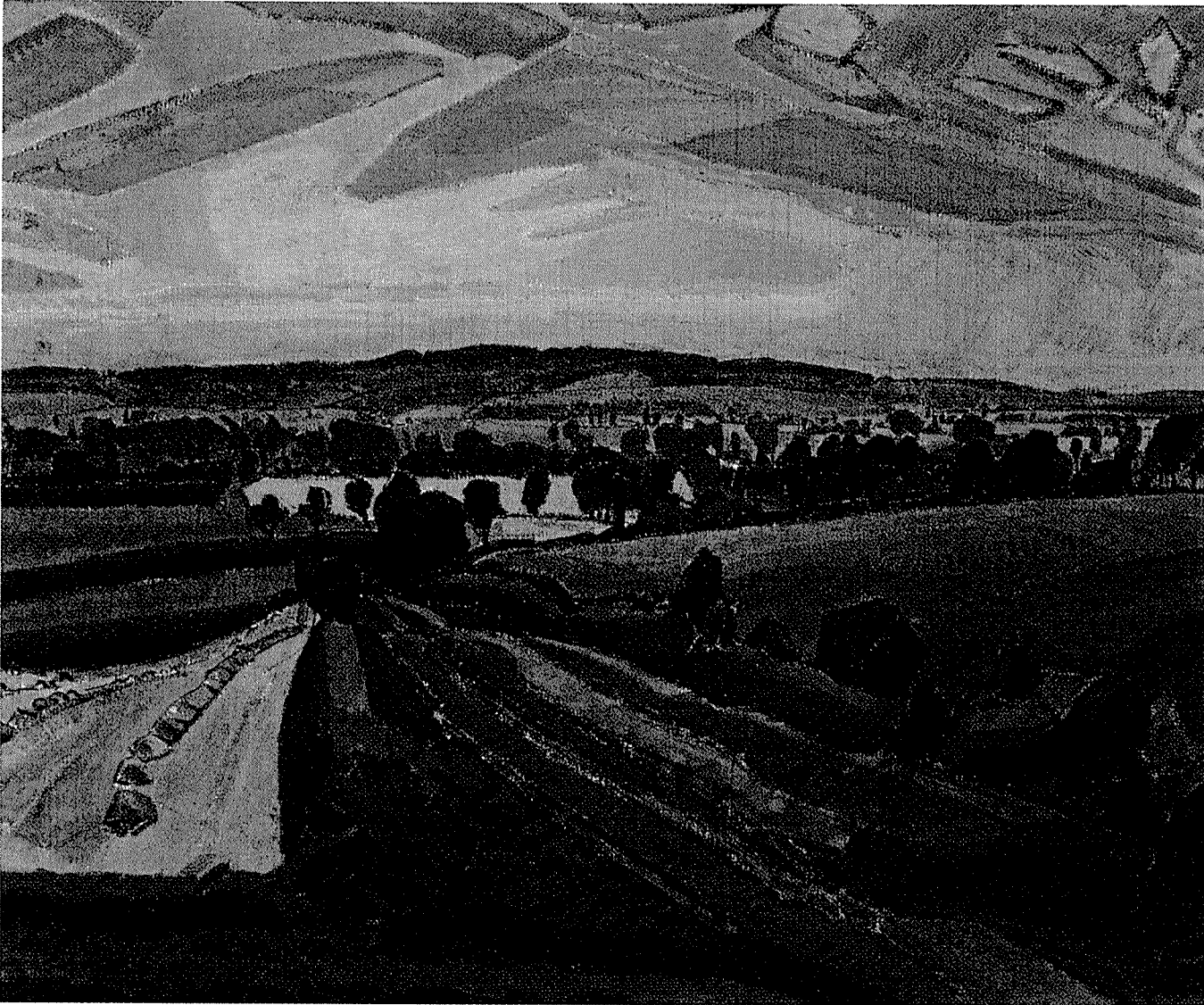
Above: Spencer Gore, English 1878–1914. The Icknield Way 1912. oil on canvas 63.4 x 76.2 cm. Art Gallery of New South Wales, Sydney. Purchased, 1962.