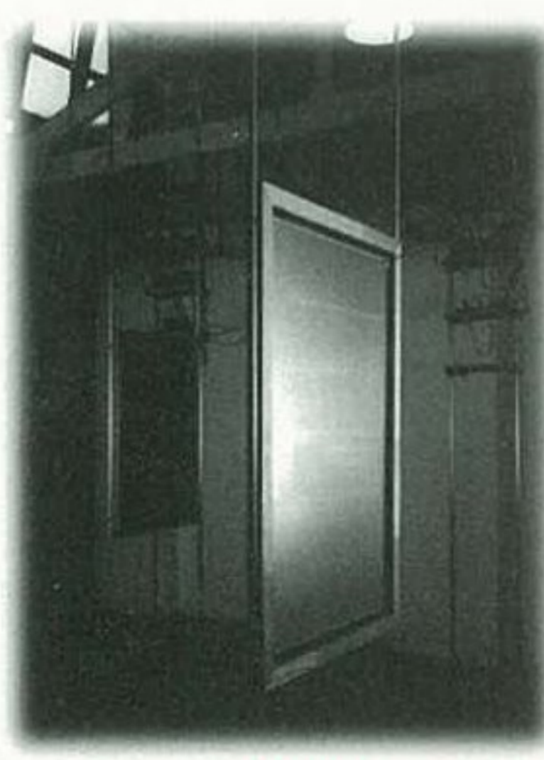
Joyce Hinterding, Electrical Storms 1993

Cloud translates satellite picture transmissions of turbulence and cloud formation to a multi-track sound installation.